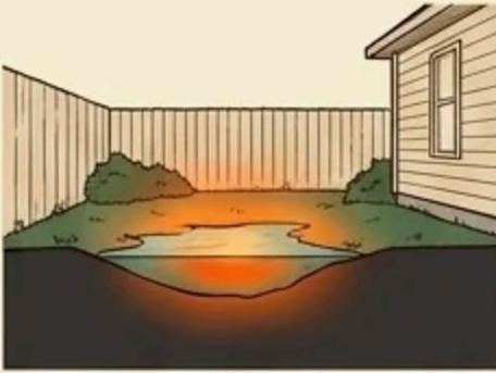
LOW SPOT PONDING