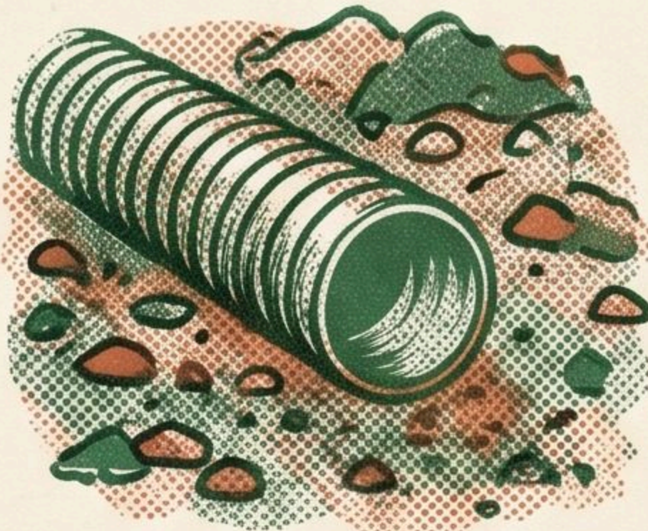
NO SOCK EVER