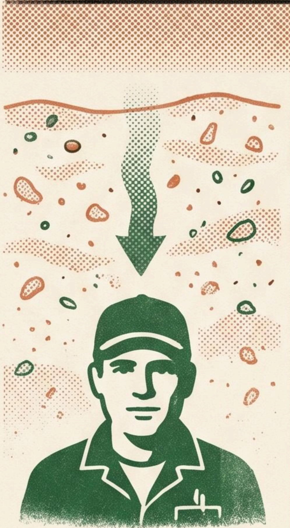
FRENCH DRAIN MAN