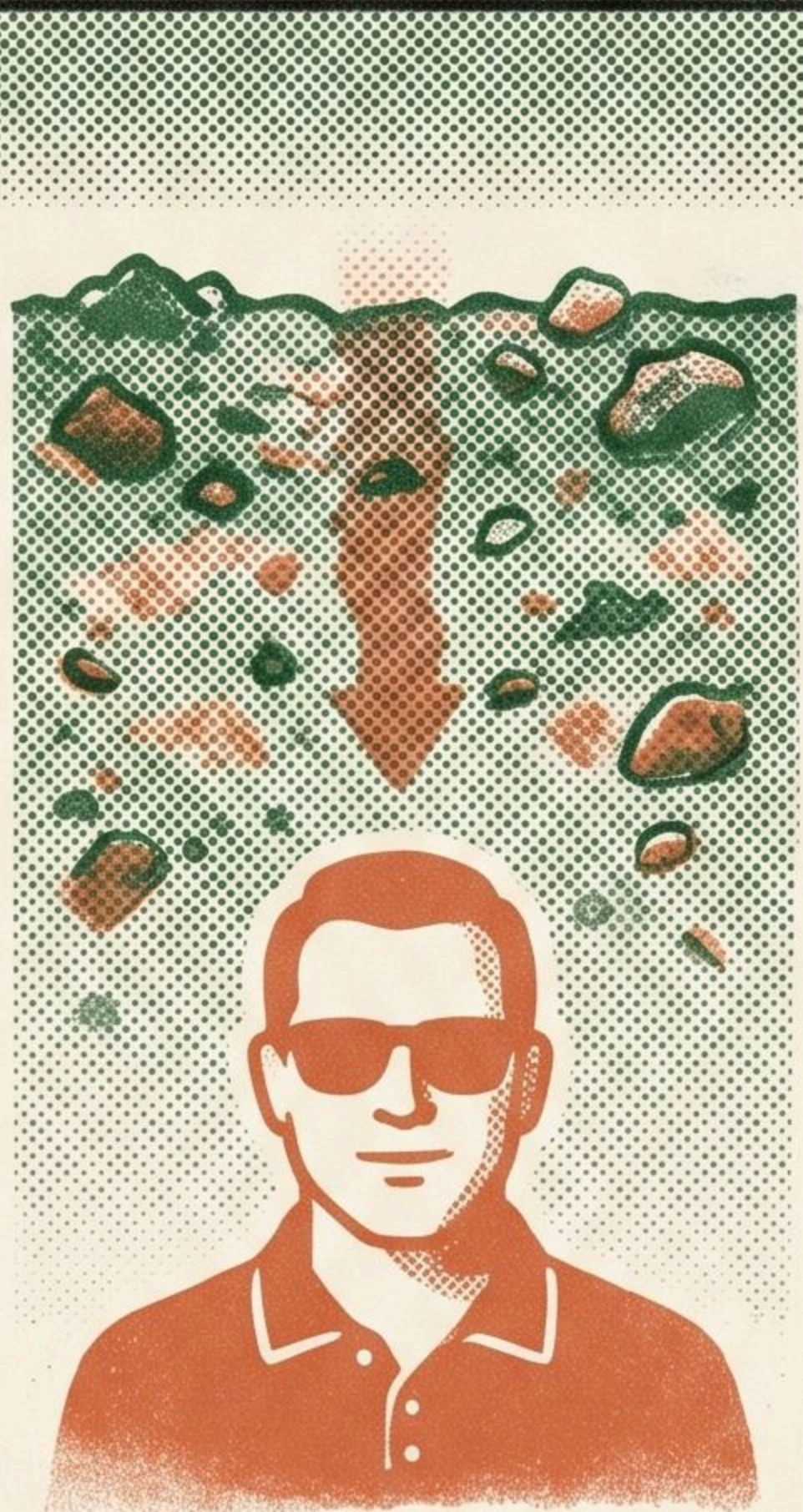
APPLE DRAINS FL