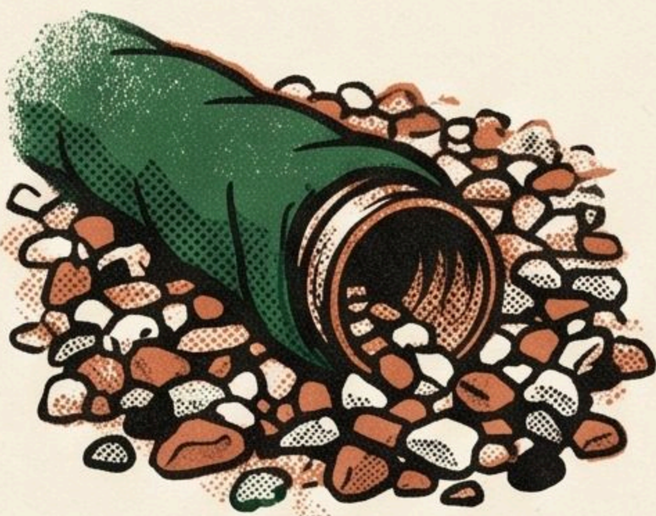
FABRIC SOCK + STONE