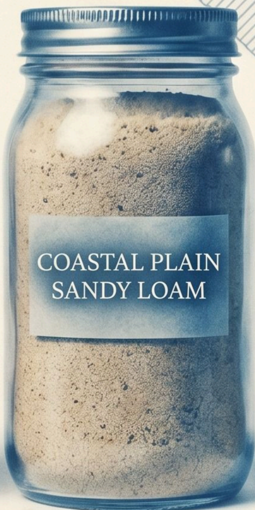
COASTAL PLAIN SANDY LOAM